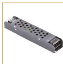
Zasilacz modułowy 60W Modular power supply 60W