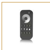
Pilot do taśm jednokolorowych Remote for single colour LEDstrips