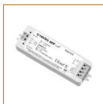
Sterownik do taśm jednokolorowych Single colour LED strips controller