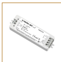
Sterownik do taśm jednokolorowych Single colour LED strips controller