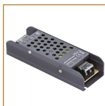
Zasilacz modułowy 100W Modular power supply 100W